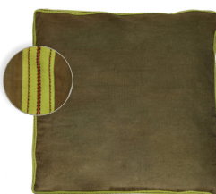
cushion L 45 x W 45 cm 41711-KHA-10