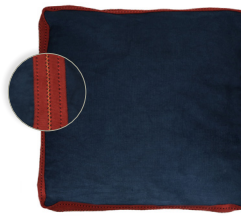
cushion L 45 x W 45 cm 41711-BLU-10