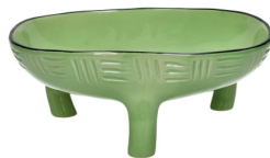
decorative platter DIA 28 x H 11,5 cm 41784-LGE-15