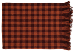
throw L 170 x W 130 cm 41824-MIX-10