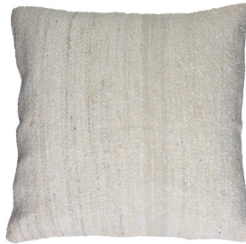
YARABA cushion - banana yarn L 60 x W 60 cm 41516-ECR-20