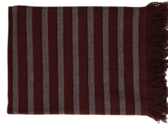
throw L 170 x W 130 cm 41825-MIX-10