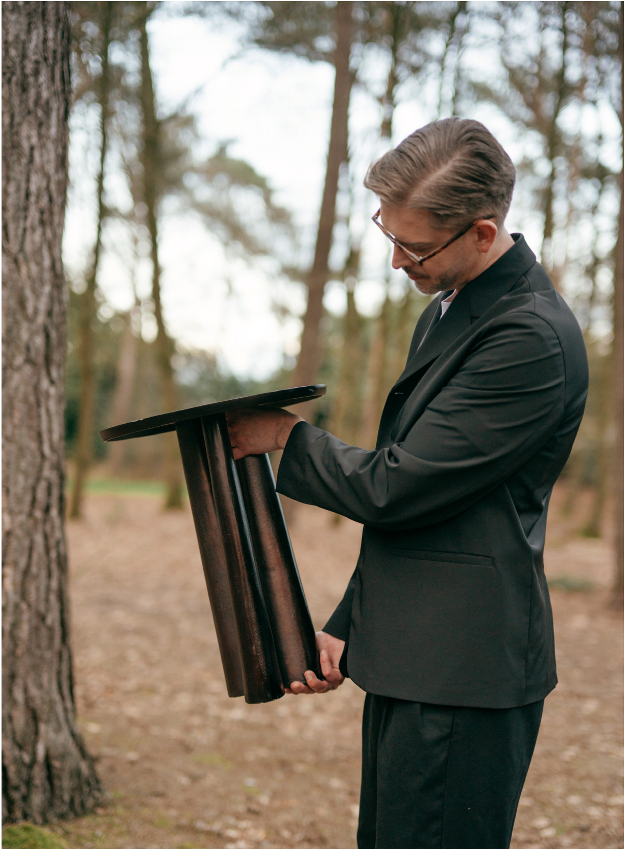
KOEN VAN TROOST FLUXA SIDE TABLES