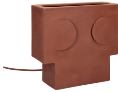
table lamp L 28 x W 10 x H 27 cm 41237-TER-10