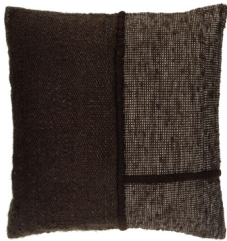
YARABA cushion - banana yarn L 50 x W 50 cm 41516-DBR-10

A story of sustainability, craftsmanship and empowerment is stitched into every thread