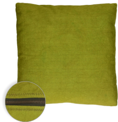
cushion L 45 x W 45 cm 41710-LIM-10