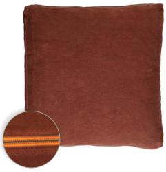
cushion L 45 x W 45 cm 41710-RUS-10