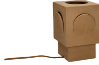
table lamp L 13 x W 13 x H 20,5 cm 41236-OCH-05