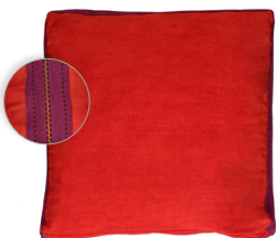
cushion L 45 x W 45 cm 41711-RED-10