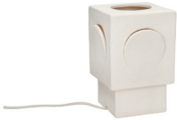
table lamp L 13 x W 13 x H 20,5 cm 41236-WHI-05