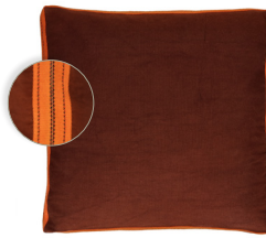
cushion L 45 x W 45 cm 41711-RUS-10