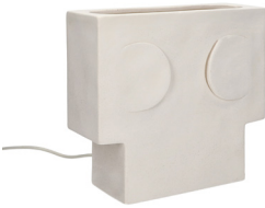
table lamp L 28 x W 10 x H 27 cm 41237-WHI-10