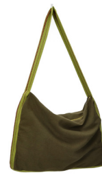
bag L 45 x W 35 cm 41789-KHA-10