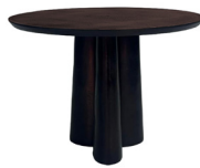
FLUXA coffee table DIA 49 x H 35 cm 41647-BRZ-10