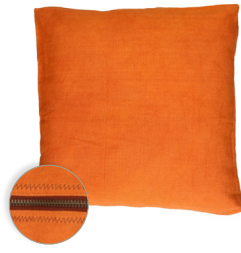
cushion L 45 x W 45 cm 41710-ORA-10