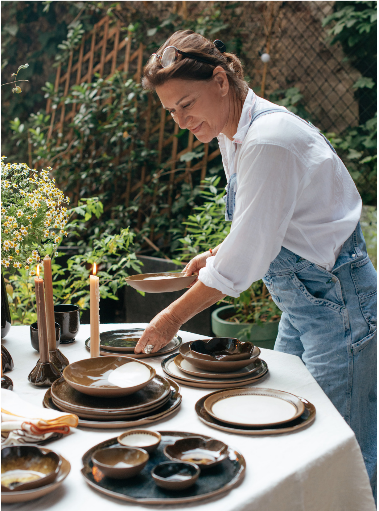
SOPHIE CASIER FOR POMAX CYCLE TABLEWARE & DECORATION