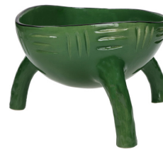
decorative platter L 27,5 x W 23 x H 18 cm 41785-DGE-15