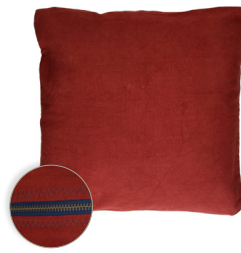
cushion L 45 x W 45 cm 41710-DRE-10