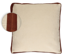
cushion L 45 x W 45 cm 41711-NAT-10