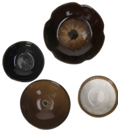
Set of 4 mini bowls