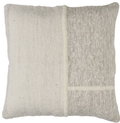
YARABA cushion - banana yarn L 50 x W 50 cm 41516-ECR-10