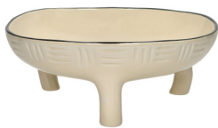
decorative platter DIA 28 x H 11,5 cm 41784-IVO-15