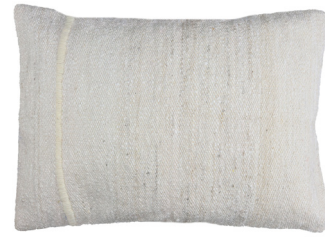
YARABA cushion - banana yarn L 70 x W 50 cm 41516-ECR-25