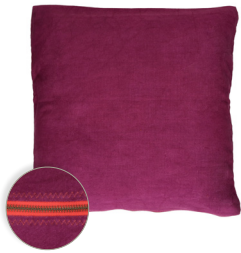
cushion L 45 x W 45 cm 41710-DPI-10