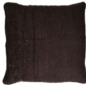
YARABA cushion - banana yarn L 60 x W 60 cm 41516-DBR-20