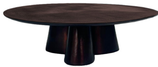
FLUXA coffee table DIA 80 x H 25 cm 41647-BRZ-20