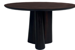
FLUXA coffee table DIA 60 x H 40 cm 41647-BRZ-15